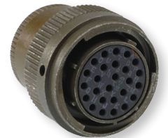
KPSE 26482-Style Series I / VG95328