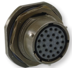
KPT 26482-Style Series I

KPT/KPSE connectors feature a positive three point bayonet coupling, five-keyway polarization and high insert arrangement contact density. They are environmentally sealed, fully intermateable and accept a wide range of interchangeable accessories.